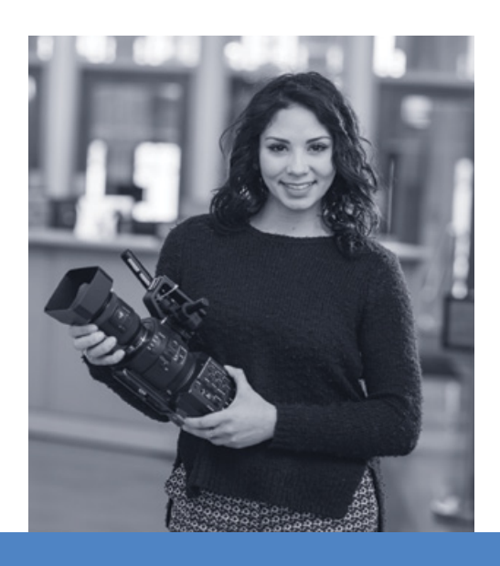
Tier 2 Public Employees Contributory Retirement System

There was a 2017-18 appropriation payable by June 30, 2018, to the Utah Governors and Legislators Retirement Plan of $391,883.