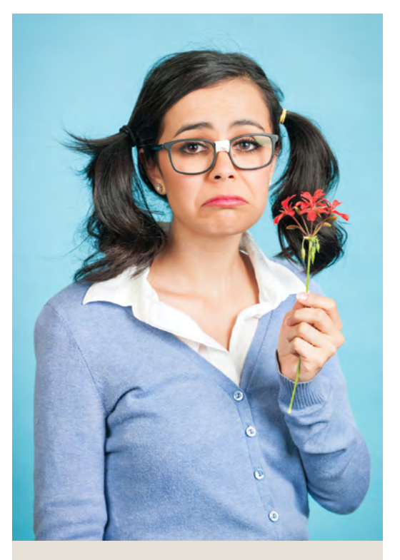
You have many great reasons to regularly log in to your myURS account (and keeping us from being sad is just one of them).

Logging in regularly to your myURS account doesn't just protect our feelings, it also protects you.